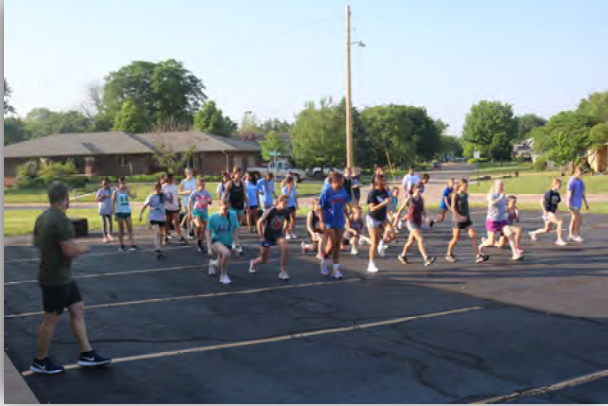
Enjoying the sun and getting their sweat on!

At Sacred Heart, summers are always filled with lots of fun and exciting activities for the students. Several sports camps took place this summer which included Junior High and High School Football Camps, Volleyball Camp, and Basketball Camps for both girls and boys. Students had the opportunities to play in summer leagues such as the 7 on 7 Football League and Girls and Boys Summer Basketball Leagues. Students also made their way back into the Weights room for Summer Weights and Conditioning.